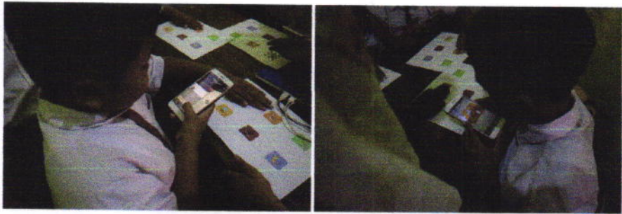
Figure 3. Students using 3Dmetric.

Table 3 shows the means and standard deviations of perception of the 36 students toward 3Dmetric. The mean of the student response toward 3Dmetric for all items in the PSUDGT is above 3.00, indicating that the students generally had positive perceptions toward 3Dmetric. The average value of the students' perceptions for point B2 (3.16) was the lowest. This result indicated that when using 3Dmetric, the students referred to an explanation of the use of the medium.